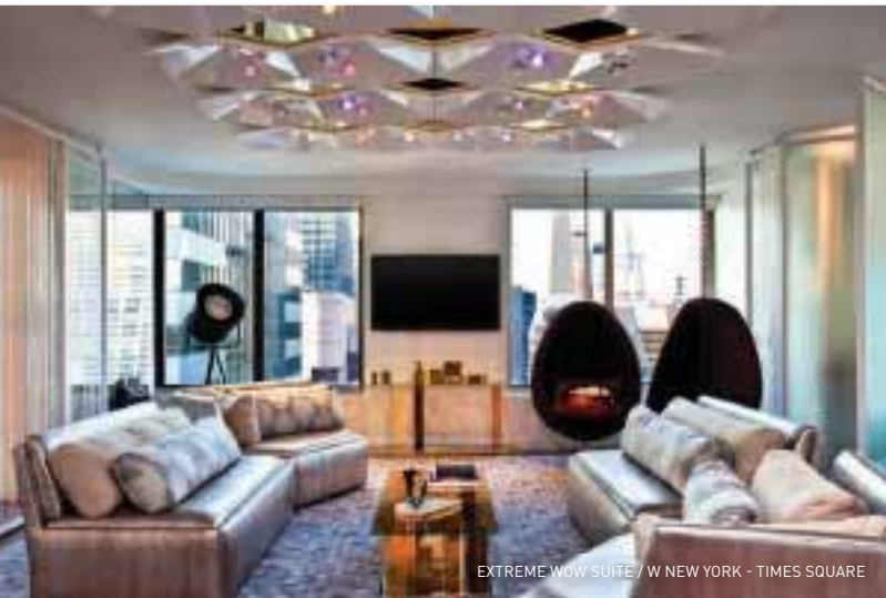
EXTREME WOW SUITE / W NEW YORK - TIMES SQUARE