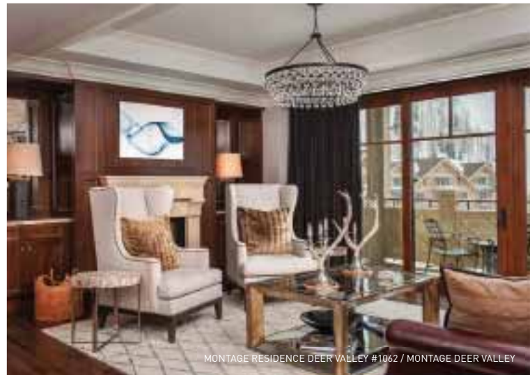
MONTAGE RESIDENCE DEER VALLEY #1062 / MONTAGE DEER VALLEY