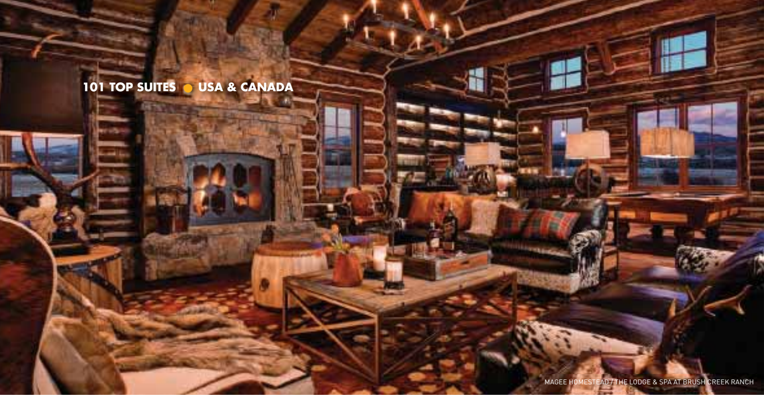
MAGEE HOMESTEAD, THE LODGE & SPA AT BRUSH CREEK RANCH