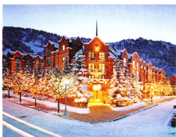
Expect an opulent stay at The St. Regis Aspen Resort.

'70s ski lodge, the hotel plays host to the slopes' chicest set.