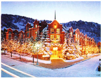
Expect an opulent stay at The St. Regis Aspen Resort.

'70s ski lodge, the hotel plays host to the slopes' chicest set.