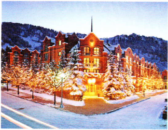
Expect an opulent stay at The St. Regis Aspen Resort.

'70s ski lodge, the hotel plays host to the slopes' chicest set.