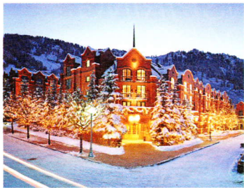
Expect an opulent stay at The St. Regis Aspen Resort.

'70s ski lodge, the hotel plays host to the slopes' chicest set.