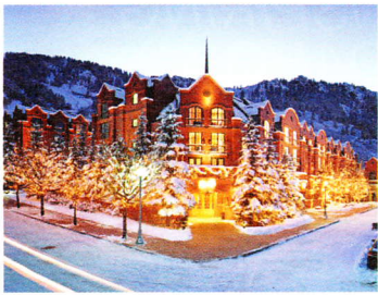
Expect an opulent stay at The St. Regis Aspen Resort.

'70s ski lodge, the hotel plays host to the slopes' chicest set.