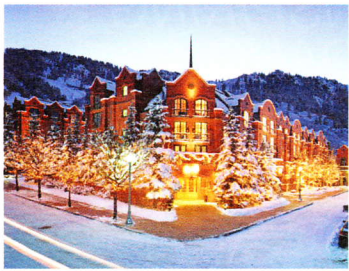
Expect an opulent stay at The St. Regis Aspen Resort.

'70s ski lodge, the hotel plays host to the slopes' chicest set.