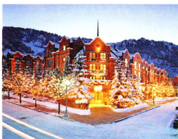
Expect an opulent stay at The St. Regis Aspen Resort.

'70s ski lodge, the hotel plays host to the slopes' chicest set.