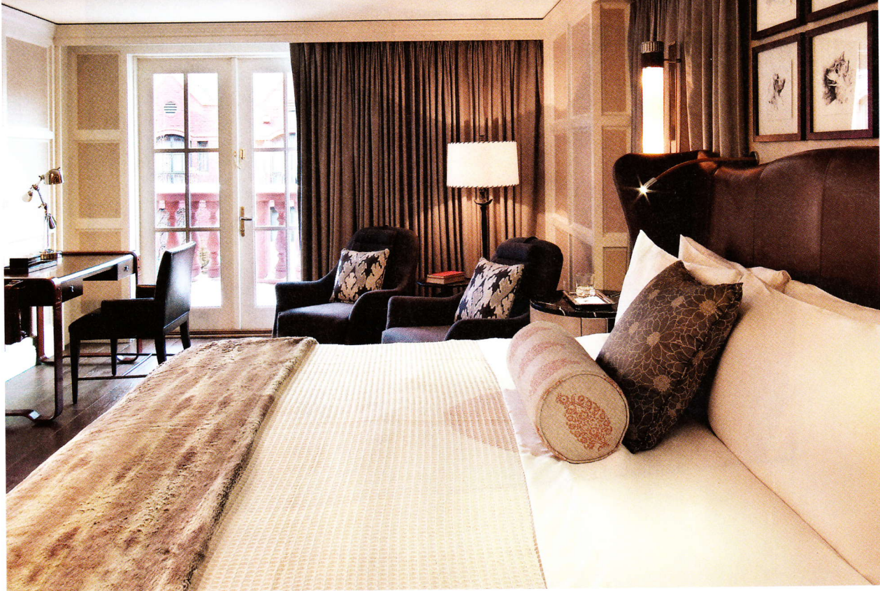
CLOCKWISE FROM TOP: COURTESY OF ST. REGIS ASPEN RESORT; COURTESY OF LIMELIGHT HOTEL; COURTESY OF SKY HOTEL/TONY PRIKRYL